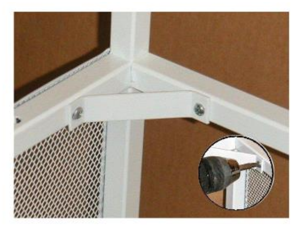
Step 3: Connect the corner braces as shown above