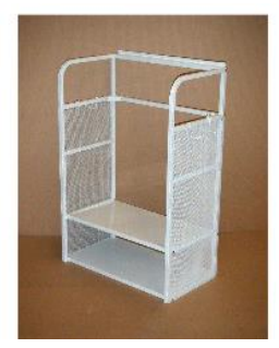
Step 5: Mount on FlexiPanel or FlexiTrack on your garage wall